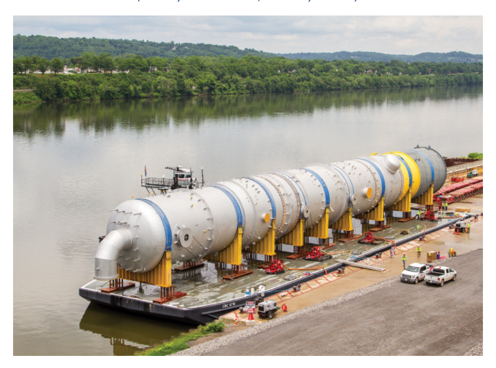
Figure 1 - The M/V Big Eddie of Crosby Marine is seen at Monaca, PA (Mile 27.9 of the Ohio River) on May 30 with a deck barge carrying a large refiner vessel for the Shell Oil Corporation ethylene cracker plant under construction. Shown here are pumps used to level the barge for unloading, and the heavy-duty flatbed carrier to transport the equipment to the construction site.

This concludes my testimony, Mr. Chairman. Thank you for providing this opportunity to be here today to address this critically important subject.